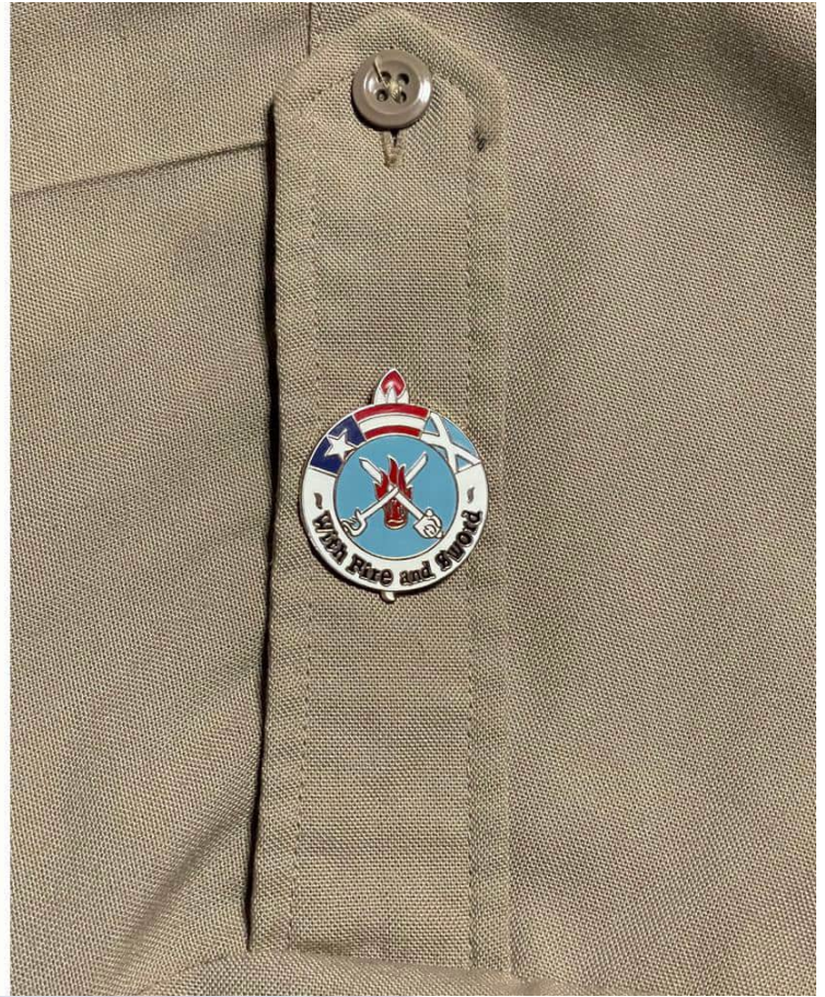
WITHOUT EPAULET COVER