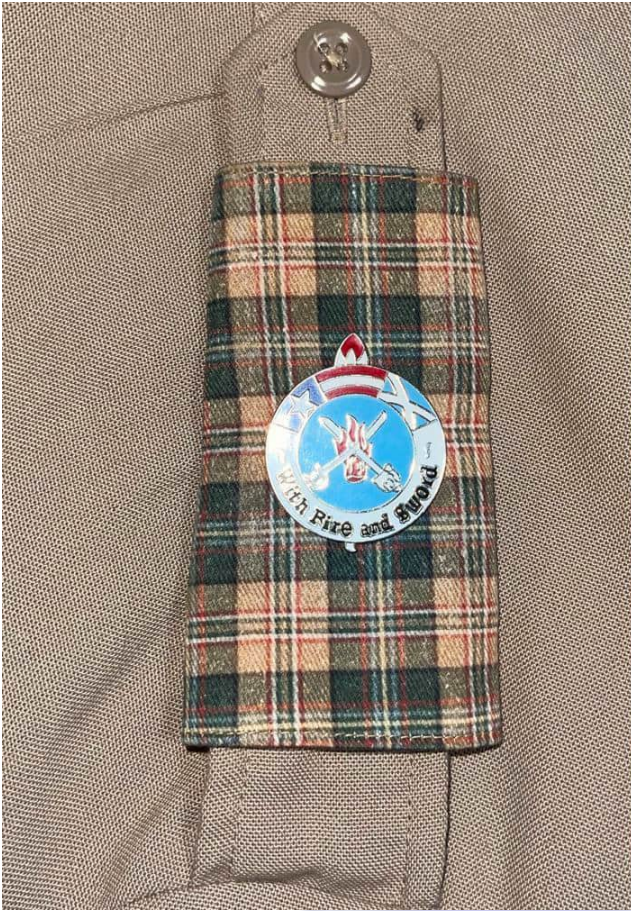
WITH EPAULET COVER